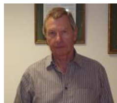
LES HASWELL P&H