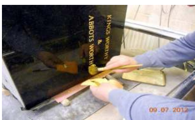
GOLD LEAF BEING APPLIED

We are pleased to say that our commemorative Diamond Jubilee Obelisk (sundial soon to be added) is now in place on the