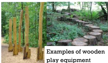
Examples of wooden play equipment

address these issues. The revised suggestions include hedging rather than the harder fencing as a barrier to the London Road side and just a very few, mainly wooden, pieces of equipment. A slide cut into the slope—possibly a small climbing wall at the side of the slide and some kind of balance equipment.