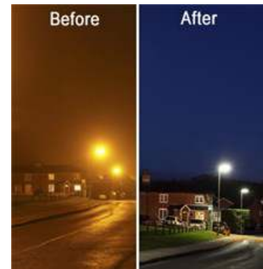
New lights reduce night -sky light pollution

Church Lane. Despite the extra lights there should overall be less night-sky light pollution and surrounding houses should be less bothered by nearby lights. Let us know what you think about this or any council activity.